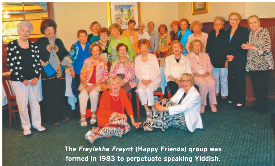
The Freylekhe Fraynt (Happy Friends) group was formed in 1983 to perpetuate speaking Yiddish.