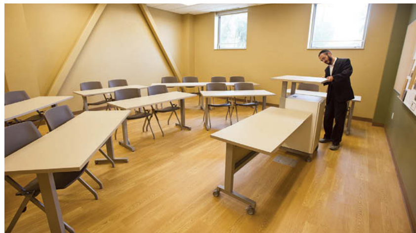
Rabbi Mendel Stein adjusts an instructor's desk in one of the classrooms.